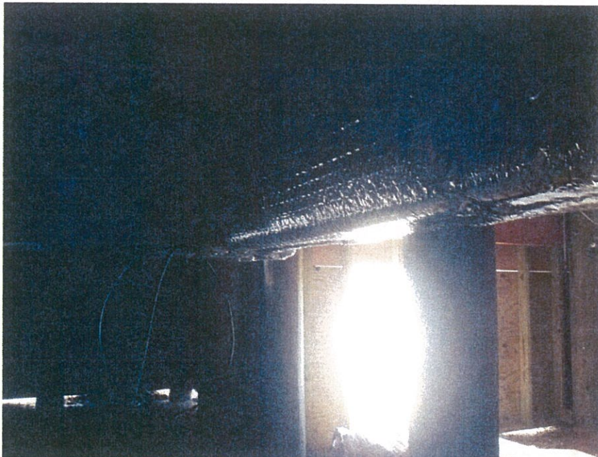
63 Hornblower Drive, Lowest Utility Duct work, 11/25/13