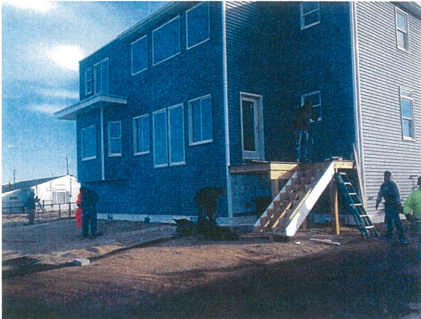
63 Hornblower Drive, Rear, 11/25/13