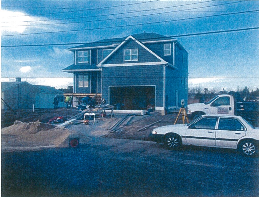
63 Hornblower Drive, Front, 11/25/13

If using the Elevation Certificate to obtain NFIP flood insurance, affix at least 2 building photographs below according to the instructions for Item A6. Identify all photographs with date taken; "Front View" and "Rear View"; and, if required, "Right Side View" and "Left Side View." When applicable, photographs must show the foundation with representative examples of the flood openings or vents, as indicated in Section A8. If submitting more photographs than will fit on this page, use the Continuation Page.